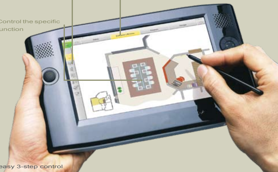
GUI Soft: easy 3-step control